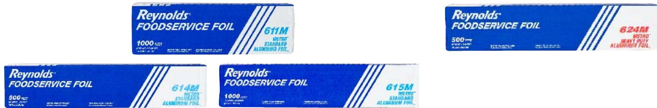
Metro Line™ Aluminum Foil - Heavy duty